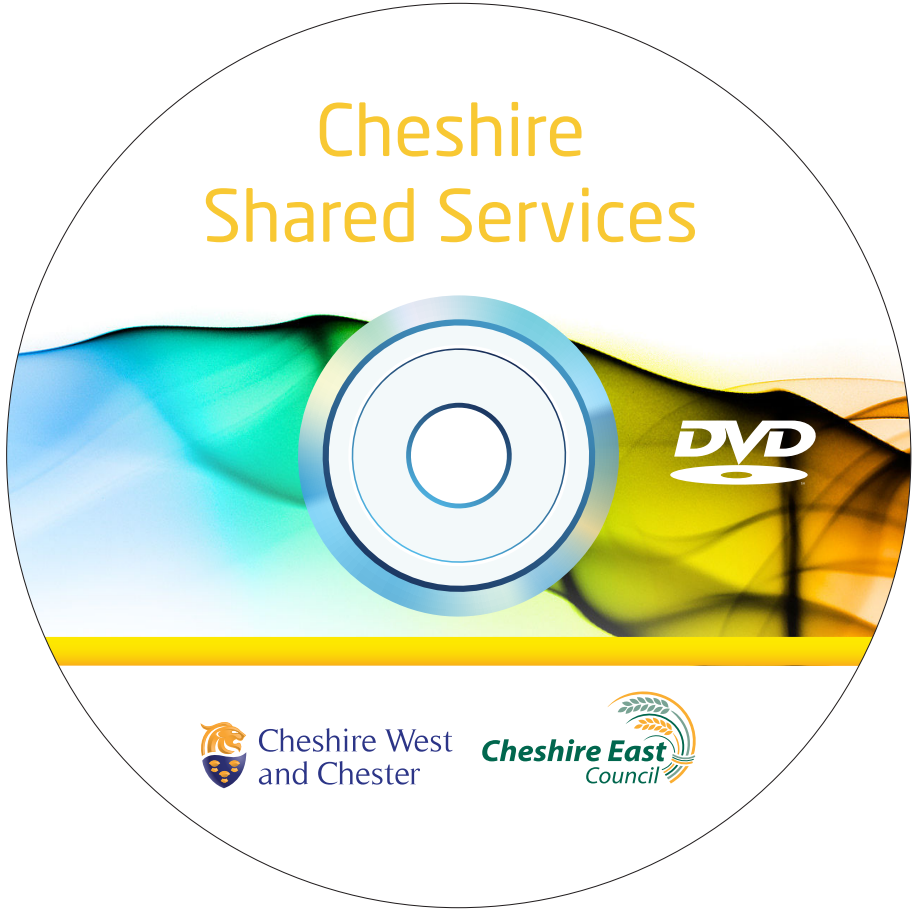
CD / DVD Label